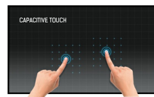
Touch technology - Capacitive

Thanks to Android OS, you can easily customize the display to your needs by installing applications directly to it.